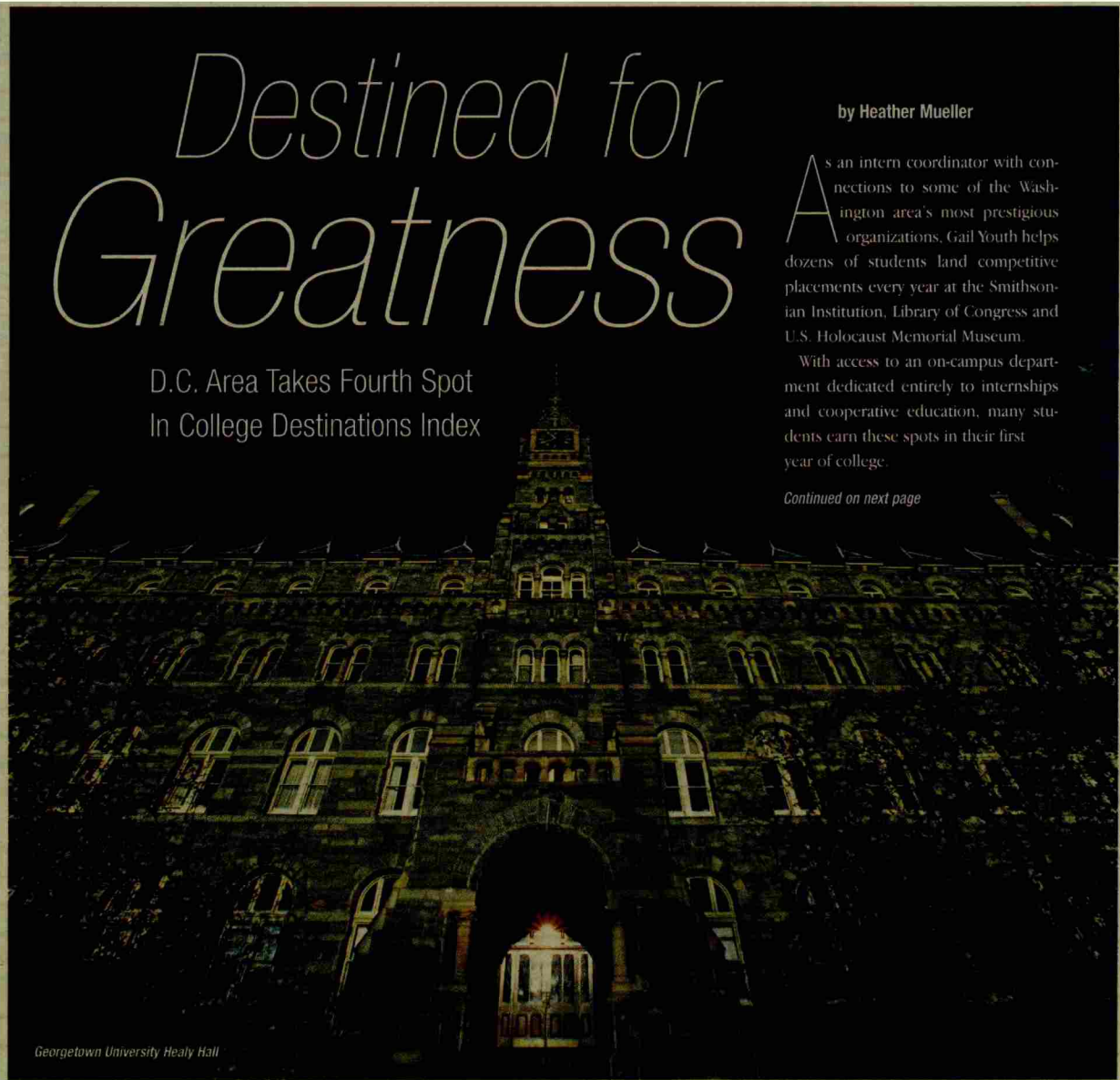
Georgetown University Healy Hall